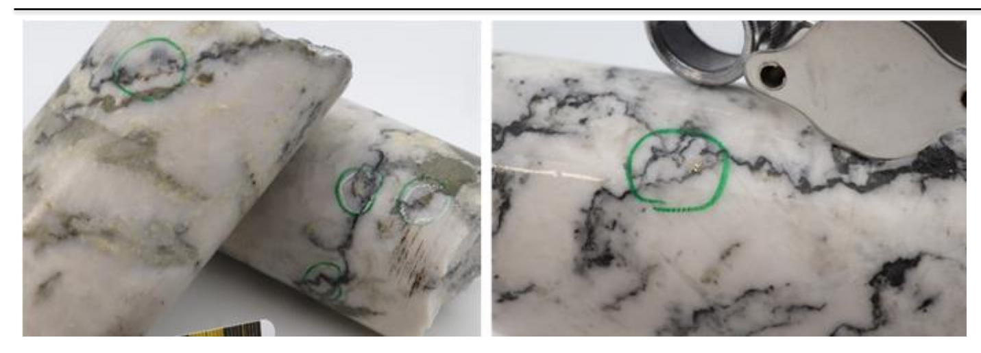
Figure 3. Photos - New Found Gold Corp's Queensway Project - Epizonal gold mineralisation in NFGC-21-195 and NFGC-21-202, Canada (from 9 March 2022 press release).