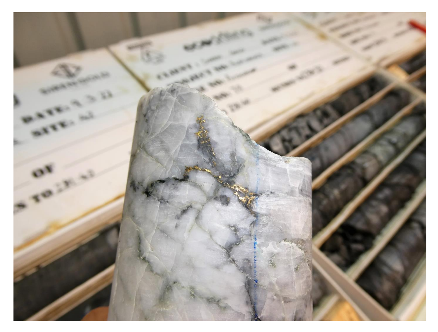
Figure 2. Significant Visible gold in Alexander River drillhole AX84 quartz reef in the McVicar West shoot.