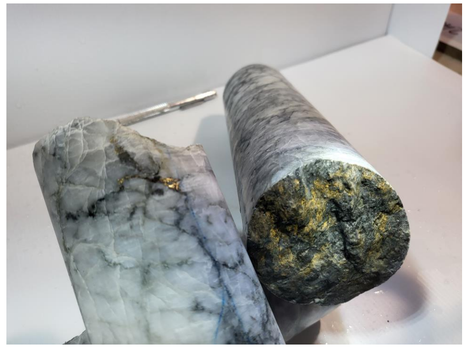
Figure 1. Significant Visible gold in Alexander drillhole AX84 quartz reef.

• Siren Gold intersects significant visible gold (Figure 1) in the deepest hole drilled to date at its Alexander River project.