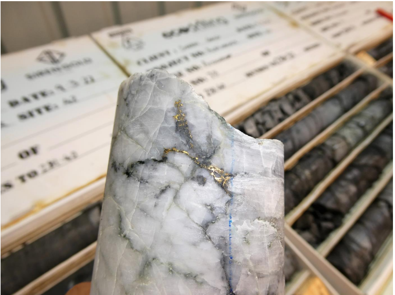
Figure 2. Significant Visible gold in Alexander River drillhole AX84 quartz reef in the McVicar West shoot.