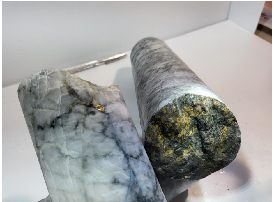
Figure 1. Significant Visible gold in Alexander drillhole AX84 quartz reef.